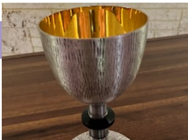
The Cup of Salvation